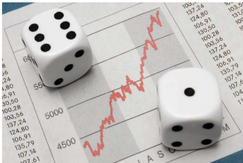
FIG 2 - Ad-hoc IT support is costly, unpredictable, and there's no guarantee of resolution.