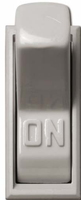
FIG 1 - Scale on demand with Hosted Desktop. hardware and applications are available at the flick of a switch.

As a part of the Hosted Desktop service, you always have access to the latest tested and proven software version. The complete Microsoft suite of products is included in every subscription, with the option to add on additional productivity tools and 3 rd party applications. In addition to accessing the latest software